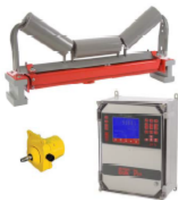
Model N-61 Belt Scale System