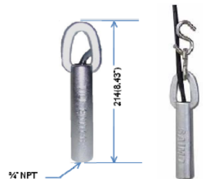
SL20-8 Tilt Switch Probe Outline Dimensions