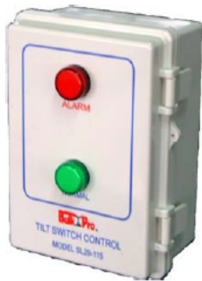
Model SL29 - 115