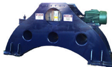
Above: Overhead Car Shaker

Overhead Car Shaker - A very heavy duty proprietary design especially for difficult unloading applications. A hoist / trolley system is required to handle the Overhead Car Shaker.