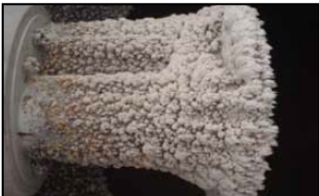
Outer unit is coated with build-up from dust. Inside the unit is clean and fully operational.