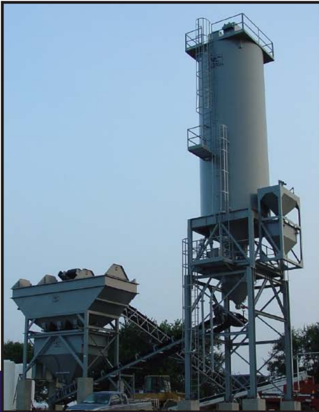
115 Comanche Batch Plant 720 Arrowhead Silo