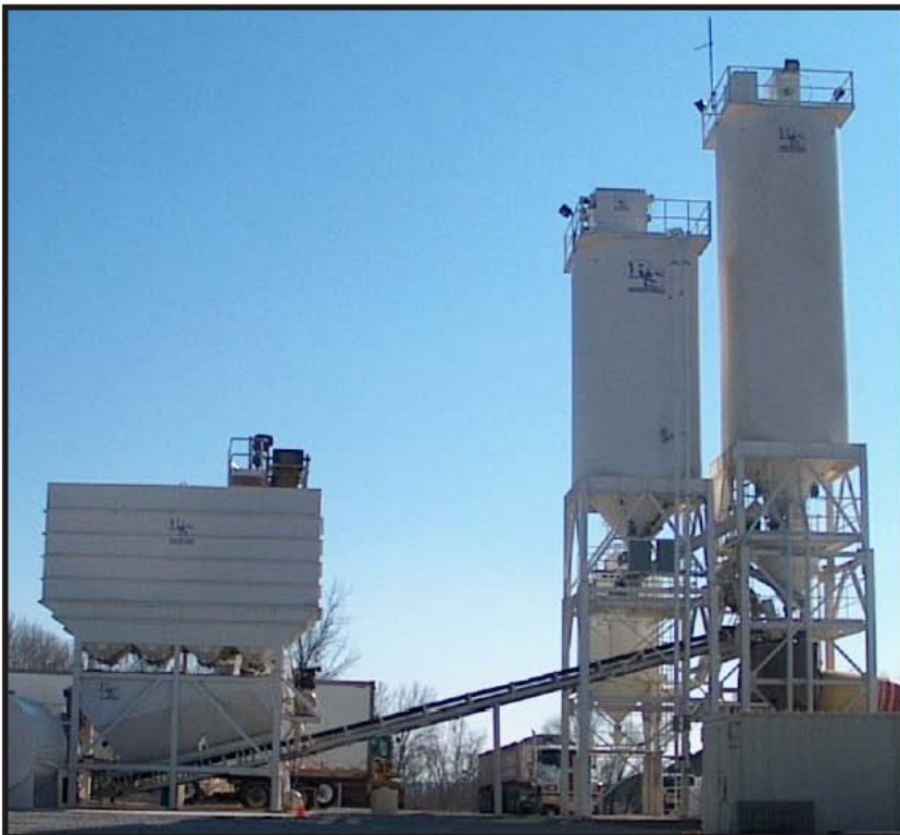
Apache Batch Plant 943 Arrowhead Silo & 720 Auxiliary Silo